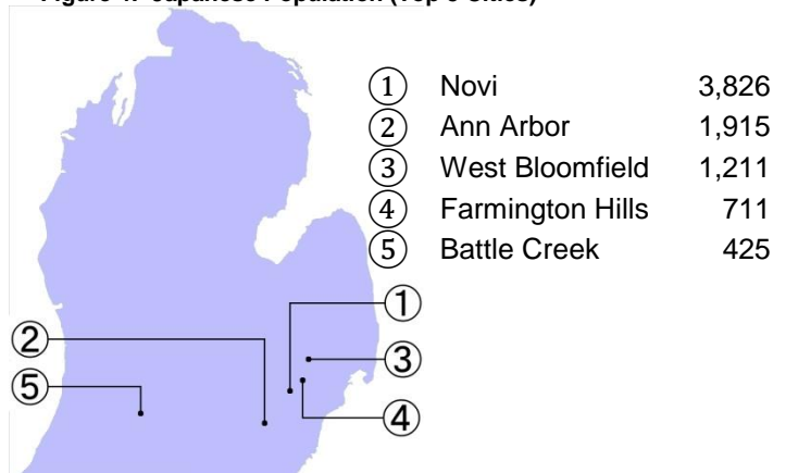
Figure 4: Japanese Population (Top 5 Cities)

As of January 2017, 14,528 Japanese nationals reside in Michigan, largely concentrated in the southeastern region of the state.